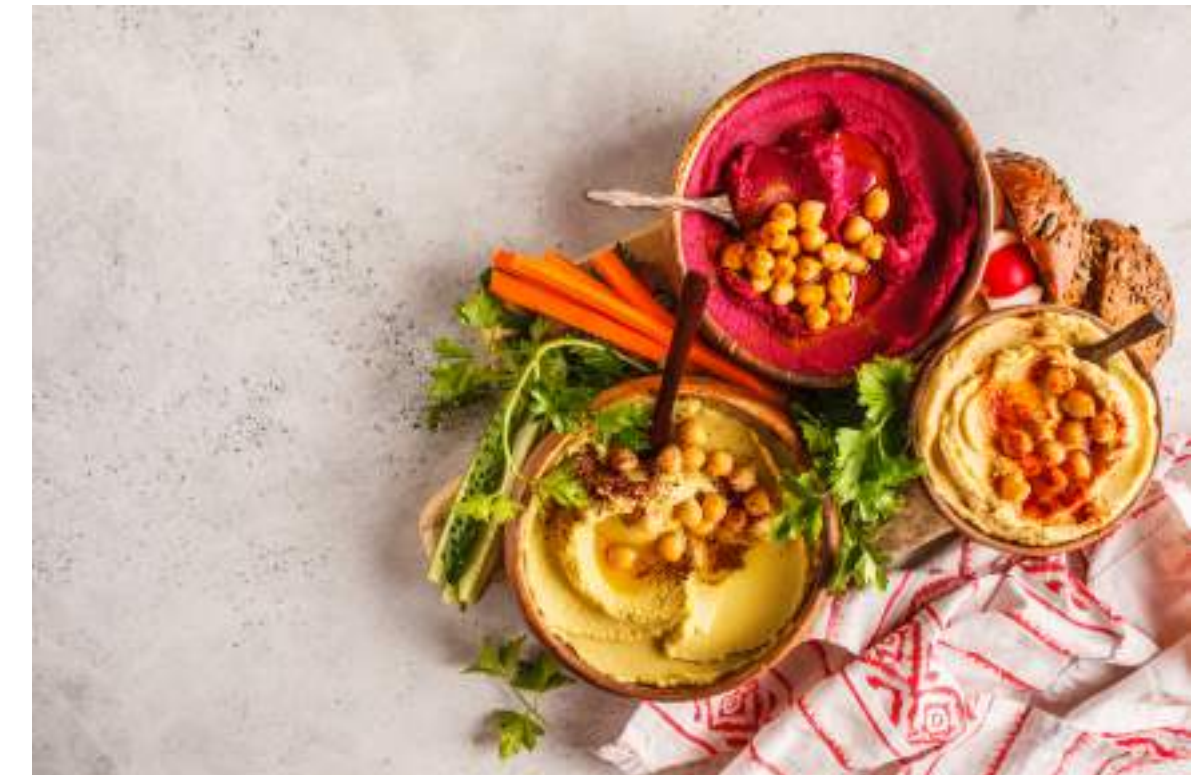
Global Hummus Market Share, By Type, 2020